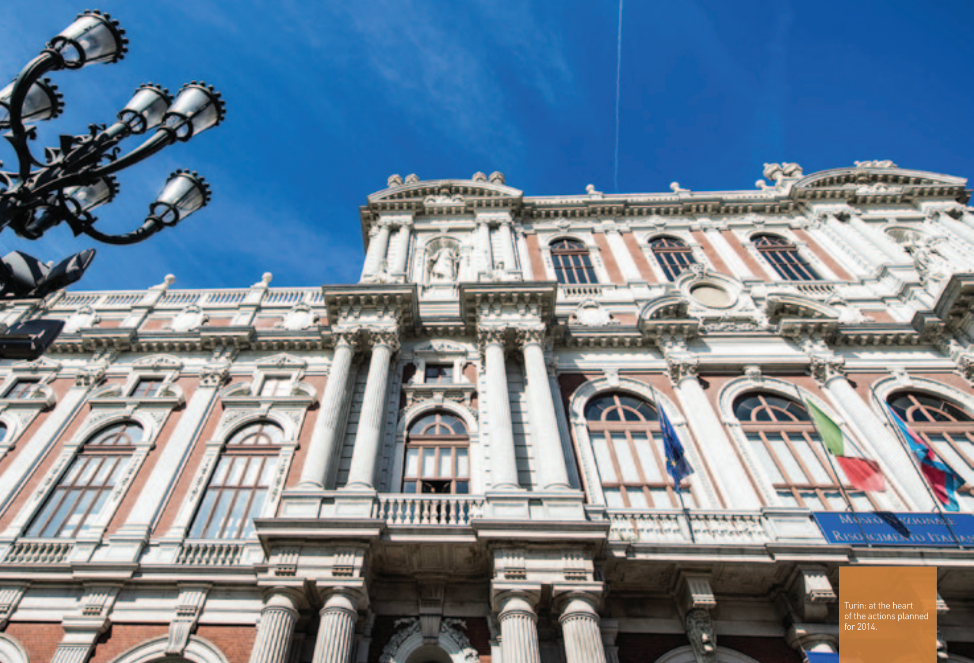
Turin: at the heart of the actions planned for 2014.

- Focusing on human resources through the creation of opportunities for qualification, study, mobility, expression – particularly among the youth, starting with children; putting the spotlight on the gender issue, to promote women empowerment. - Supporting research, prompting innovation in institutions and facilitating contacts between research,