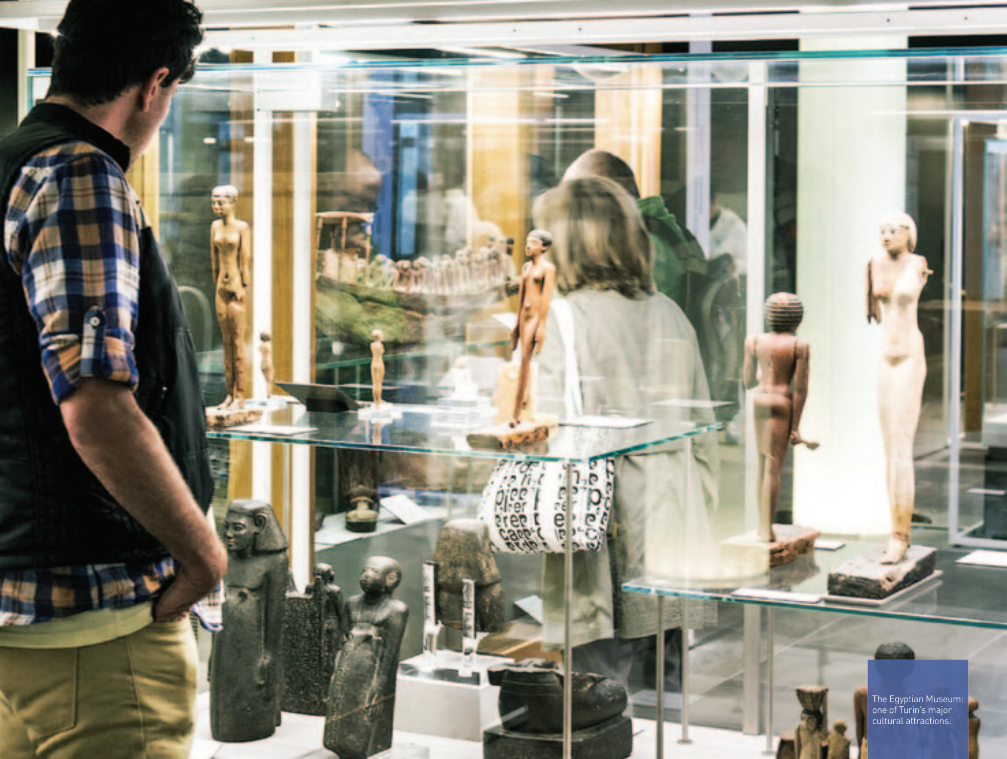
The Egyptian Museum: one of Turin's major cultural attractions.

In Turin in 2014 the Compagnia's actions will continue to focus on the central museum district and the recovery of ancient palaces that were once the cradle of power and culture under Savoy rule and that are home today to museums and