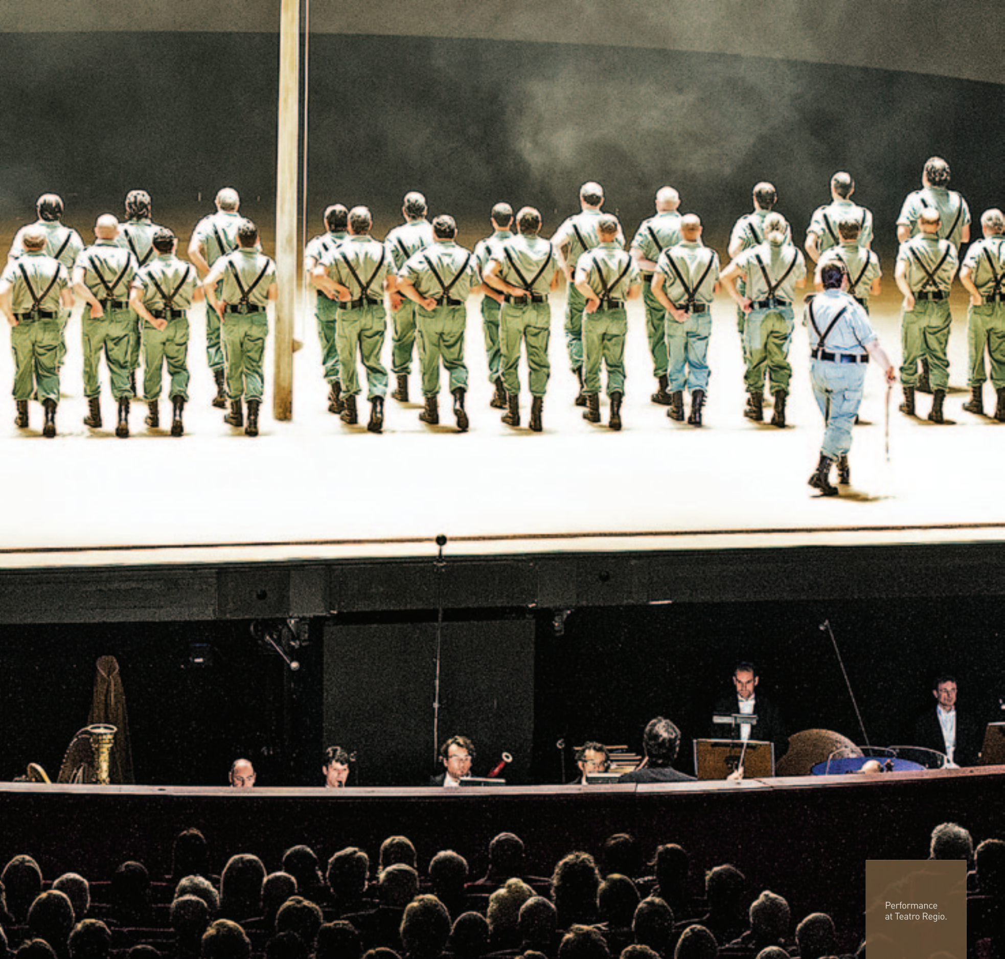
Performance at Teatro Regio.