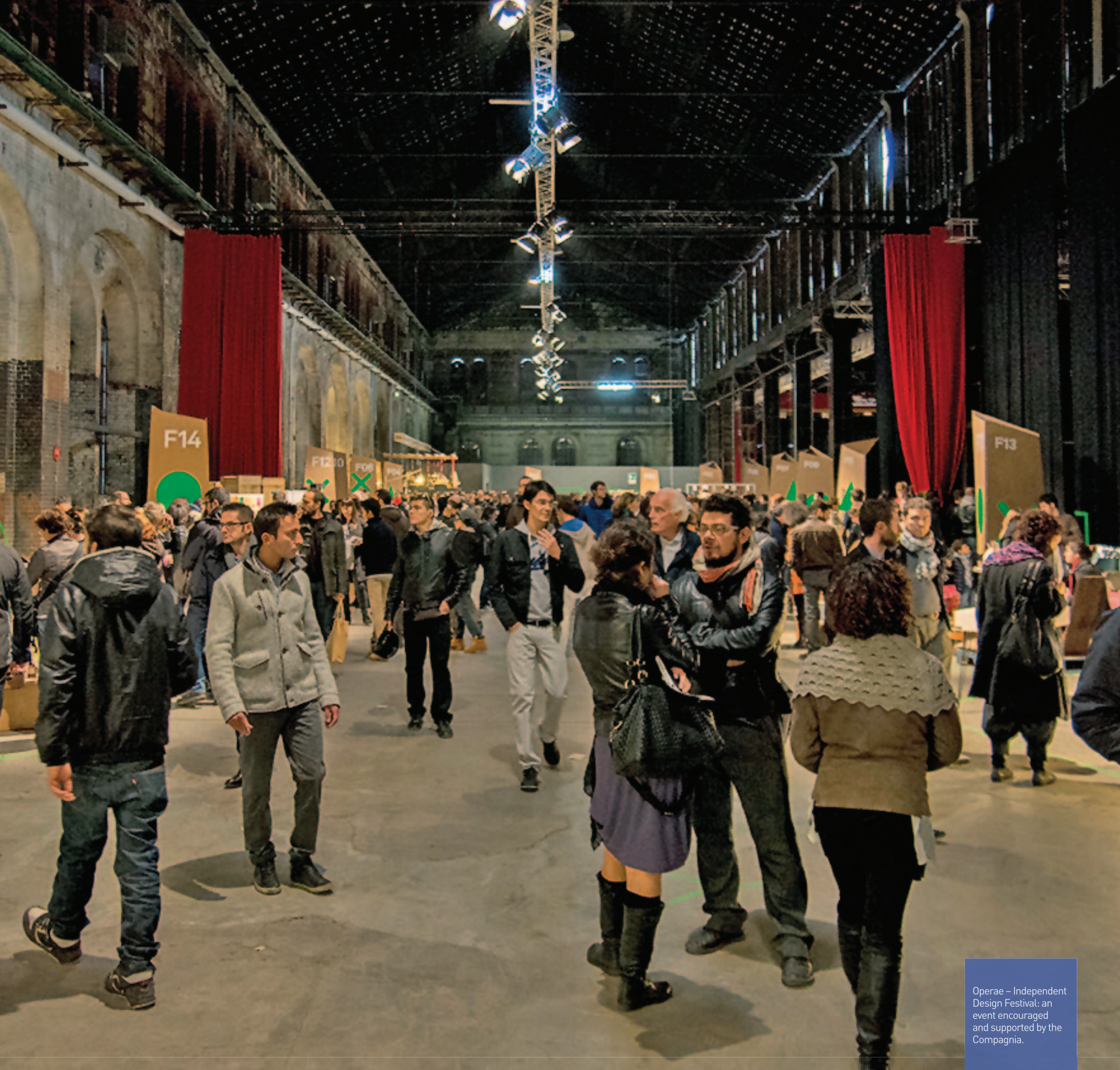
Operae – Independent Design Festival: an event encouraged and supported by the Compagnia.