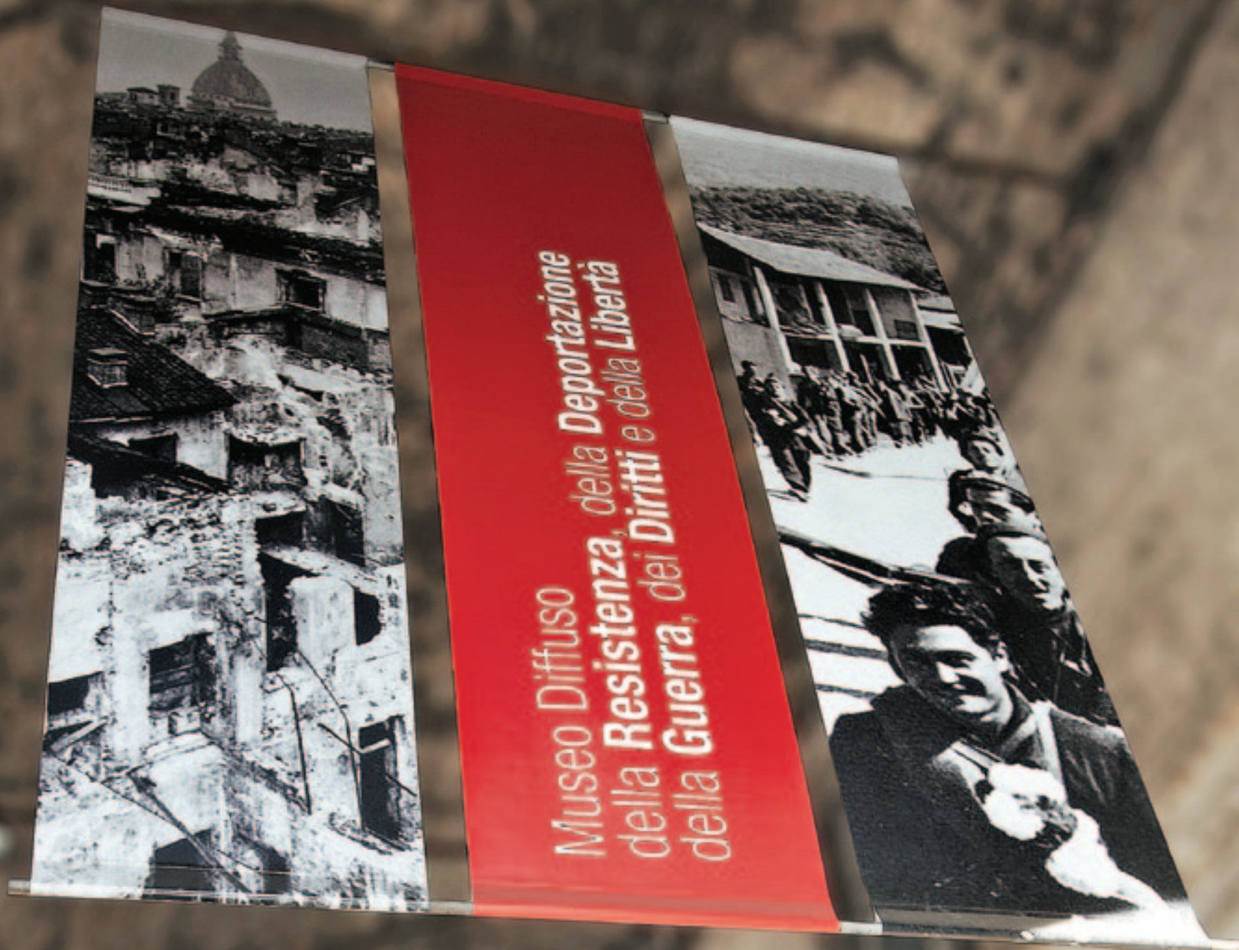
Museo Diffuso della Resistenza: an example of the promotion of the cultural heritage.

the Compagnia has invested 7 million euros in this project and it is also engaged in the definition of questions that remain open.