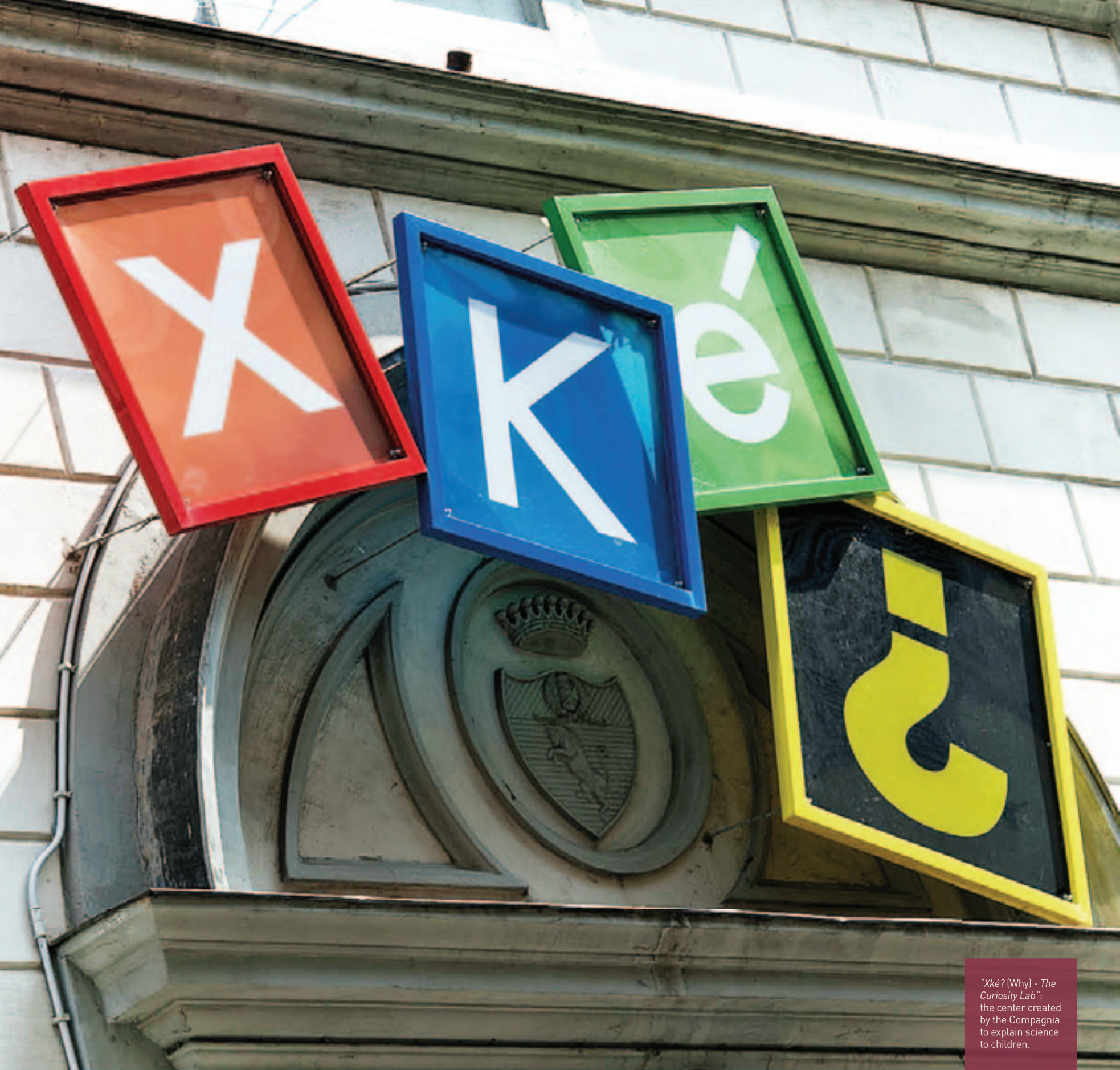
"Xké? [Why] - The Curiosity Lab": the center created by the Compagnia to explain science to children.